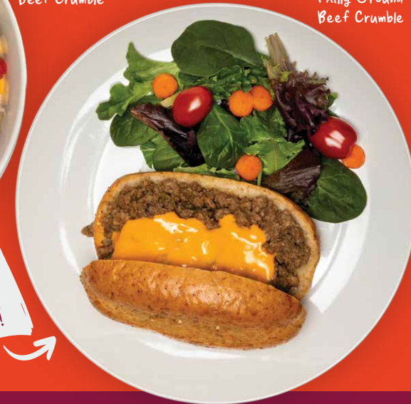
Philly Ground Beef Crumble

Free of the top 8 allergens & made with no artificial flavors or colors!