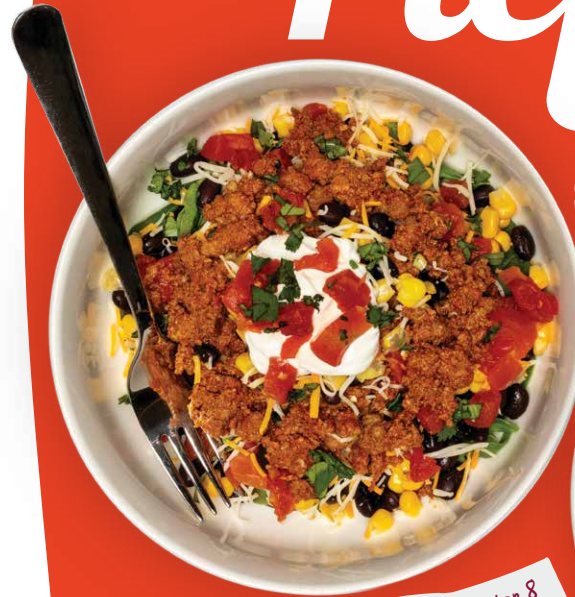
Chipotle Beef Crumble